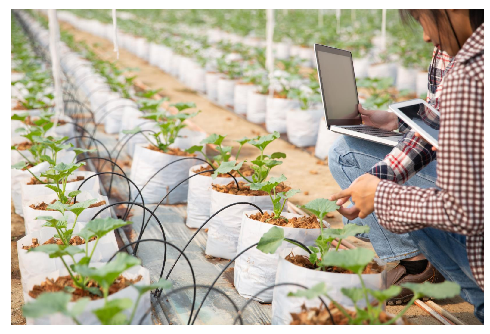
Young woman monitoring a plantation